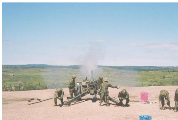
DP1 Course, Petawawa