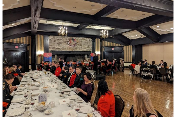
St Barbara's Day Combined Mess Dinner with 32 CER, 2 Dec 2023, The Old Mill