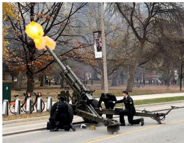
Remembrance Day Gun Salute 11 November 2023, Queen's Park