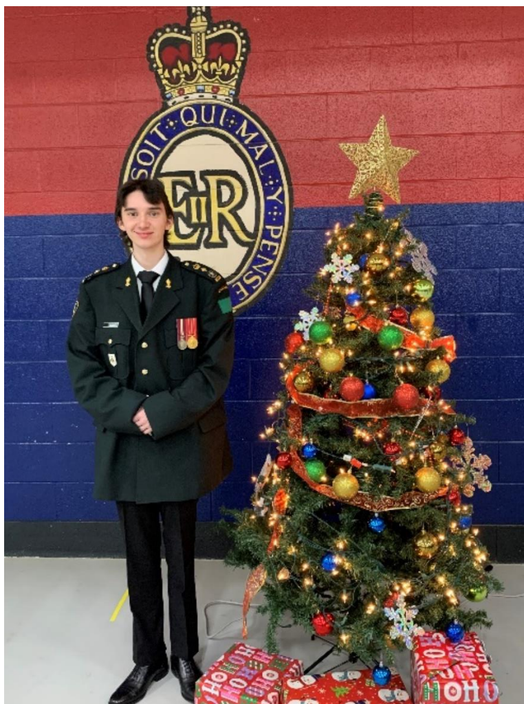
The youngest serving Gunner who is traditionally made CO for the duration of the Soldiers Appreciation Dinner

Wishing you Happy Holidays and great year in 2024!