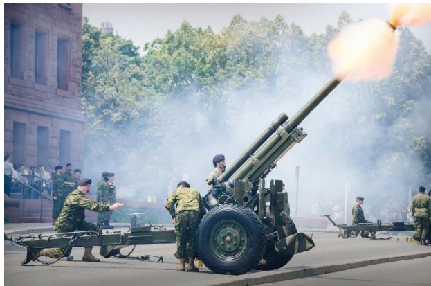
Canada Day Gun Salute 1 July 2023, Queen's Park