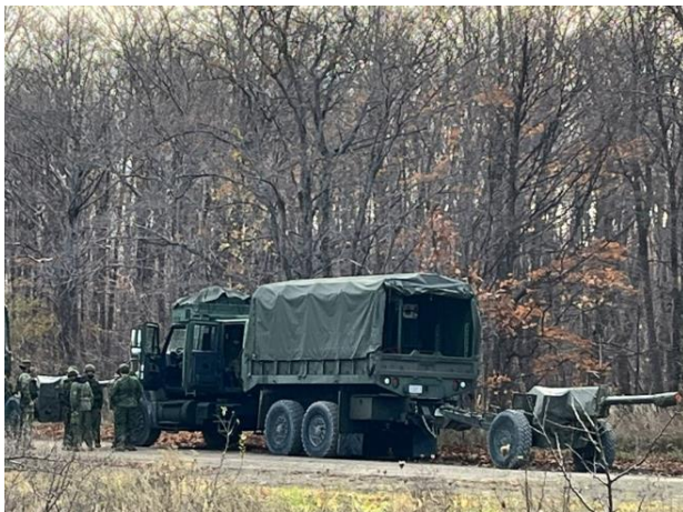
Nov Gun FTX weekend in Meaford