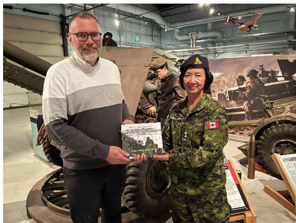
7 Toronto History book donation to CFB Shilo Artillery Museum