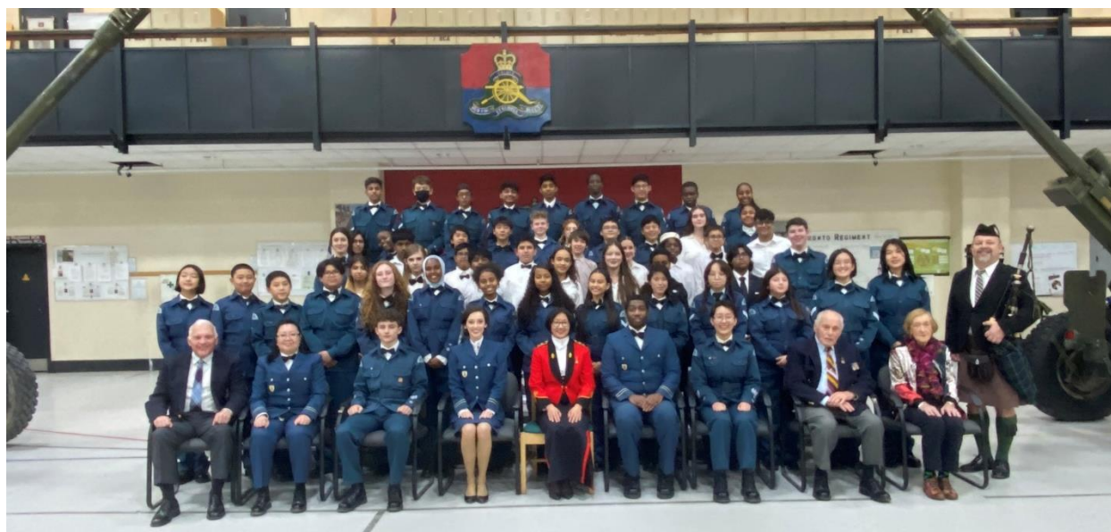
819 RCAC Squadron Mess Dinner, 18 Dec 2023

2023 was a momentous year for 819 Royal Canadian Air Cadets Squadron as they marked their 50 th Anniversary in June with a celebration.