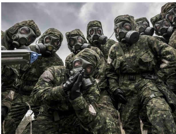
7 th Toronto Regt sends members to complete and instruct CBRN Defence NCO and Radiation Safety Specialist course