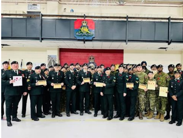
Thank you cards made by local grade 3-4 students received by 7 th Toronto Reg Soldiers to thank them for their service.