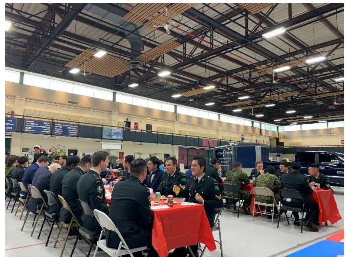
Soldiers Appreciation Dinner, 16 Dec 2023