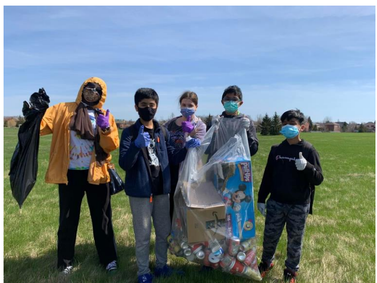
105 Cadets pose with the garbage collected during the community clean up held on April 30th, 2022.

If there is something cadets at 105 love doing the most, it's serving their community. With the gradual removal of covid-19 restrictions, returned opportunities for cadets to volunteer and get active around the neighbourhoods of Mississauga. The most notable event 105 cadets volunteered at was the Lisgar Fields community Park clean-up held on April 30th. In total, 37 cadets participated in the cleanup. Not only was the weather beautiful, but the cadets displayed how committed they are to giving back and serving others beyond themselves.