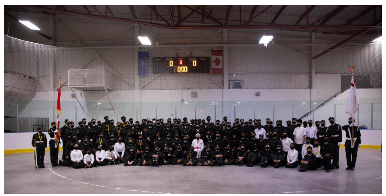
Year-end Annual Review held 11 June 2022