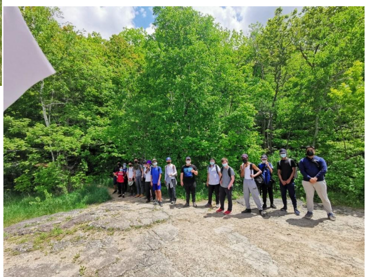
Cadets stop for a break along their 9km hike during the Nav Trek FTX held on May 29, 2022.

From May 28-29, 105 cadets participated in the Nav Trek FTX both at the cadet centre and at Kelso Provincial Park. Applying GPS and navigation concepts taught in class, cadets were split into teams and together, they hiked about 9km around trails with varying levels of difficulty. Other activities also included a scavenger hunt to engage cadets in friendly competition. Despite the heat and getting lost multiple times, cadets enjoyed the experiential learning that was provided at Kelso!