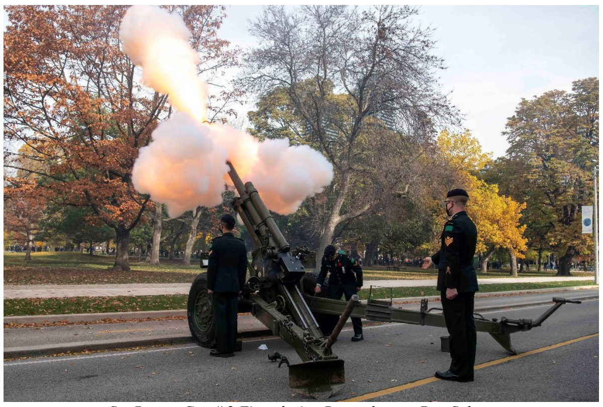
\textit{Sgt Potts} - \textit{Gun} \ \# \ 2 \ \textit{Fires during Remembrance Day Salute}.