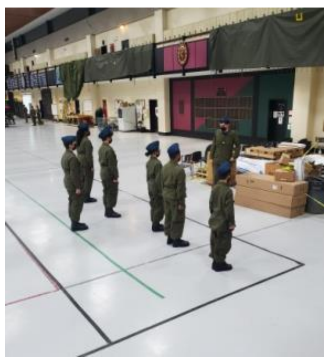
A newly promoted Flight Sergeant teaching a drill class to a group of new recruits.