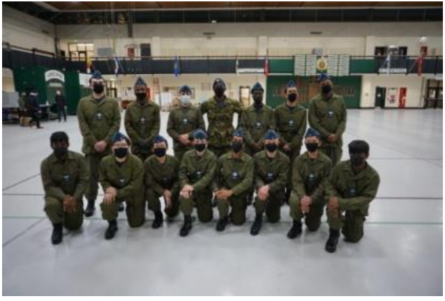
818 Sr Cadets after they completed their 6 week developmental Training Course.

However, we are all working to make the best out of what is at our disposal to give the cadets as many opportunities to develop skills, learn new things, understand the importance of serving and advance themselves and those who they aim to impact.