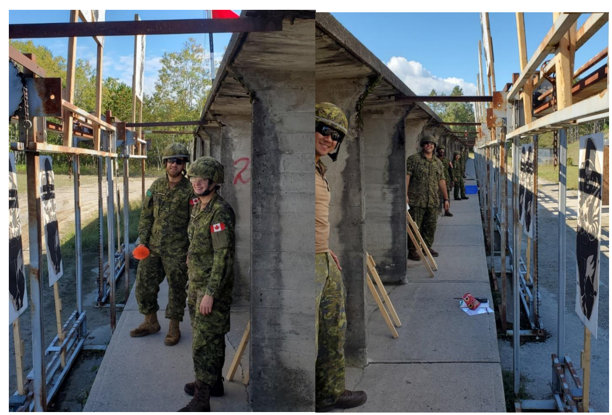
Butts Party - Ex Sharp Shooter 1, Borden ON

It is my hope that everyone and their families are able to continue working, or going to school during the pandemic. I look forward to being able to return to 100% parading in person at some point in the near future. Stay safe and healthy!